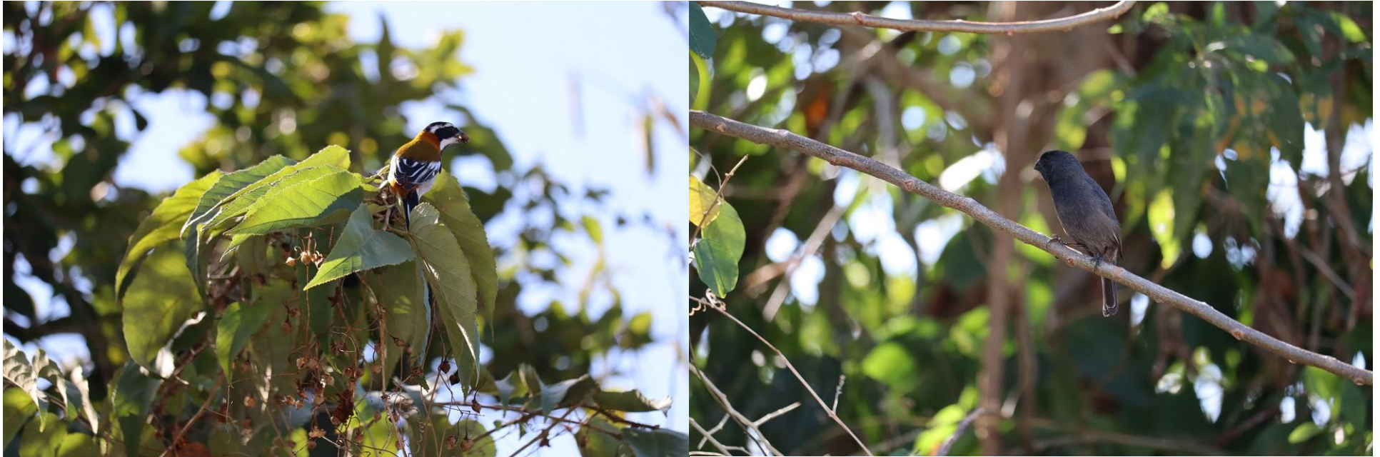
Western Spindalis and Cuban Bullfinch

Cuban Bullfinch- Melopyrrha nigra - Common, but only seen some of them on Cueva de los Portales, Santo Tomás and Cayo Coco.