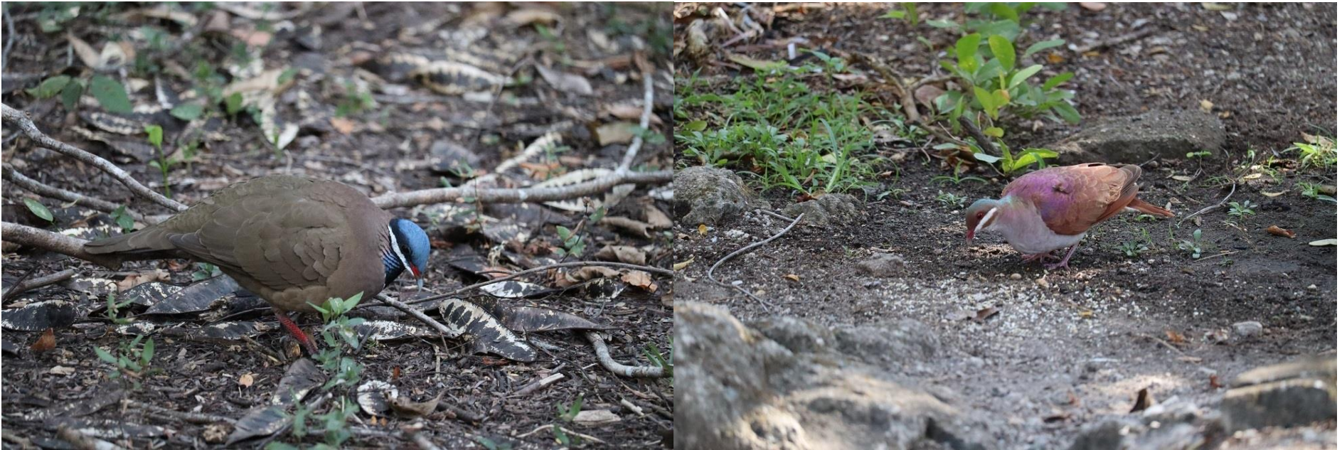
Blue-headed Quail-Dove and Key-West Quail-Dove

Common Ground-Dove – Columbina passerina - Widespread and common.