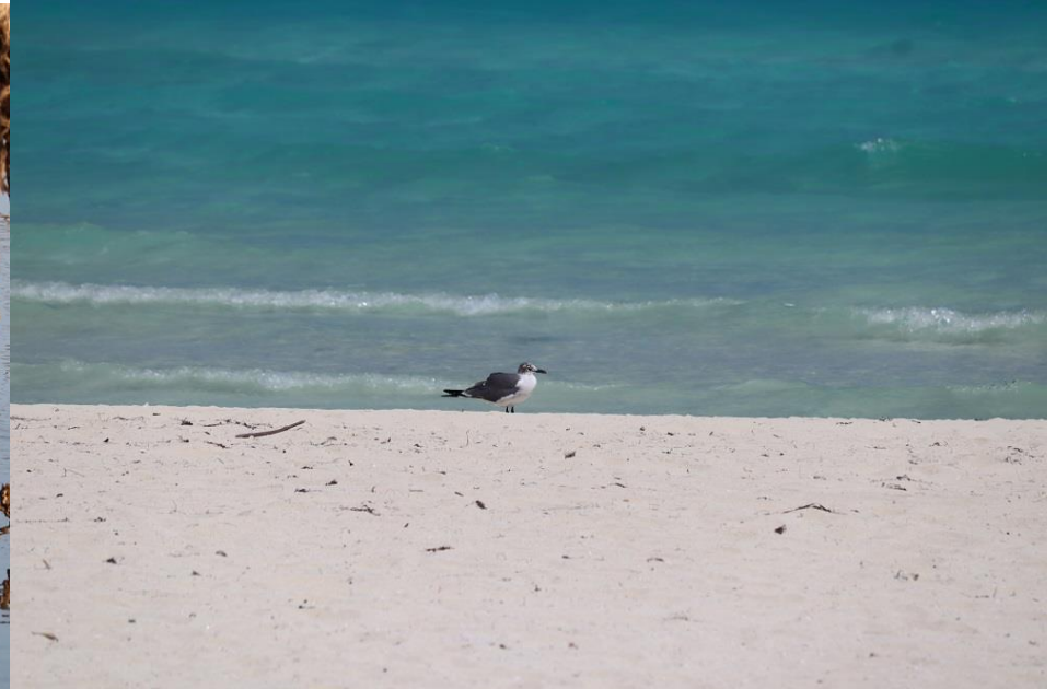
Short-billed Dowitcher and Laughing Gull

Short-billed Dowitcher- Limnodromus griseus - A flock of fifty on Cayo Coco.