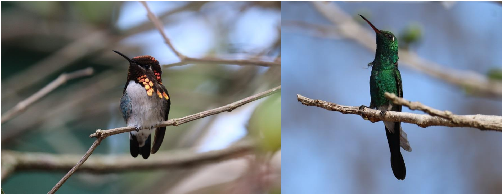
Bee Hummingbird and Cuban Emerald

Bee Hummingbird * – Calypte helenae - Most prominent on Pálpite and Caletón. Good view on Santo Tomás.