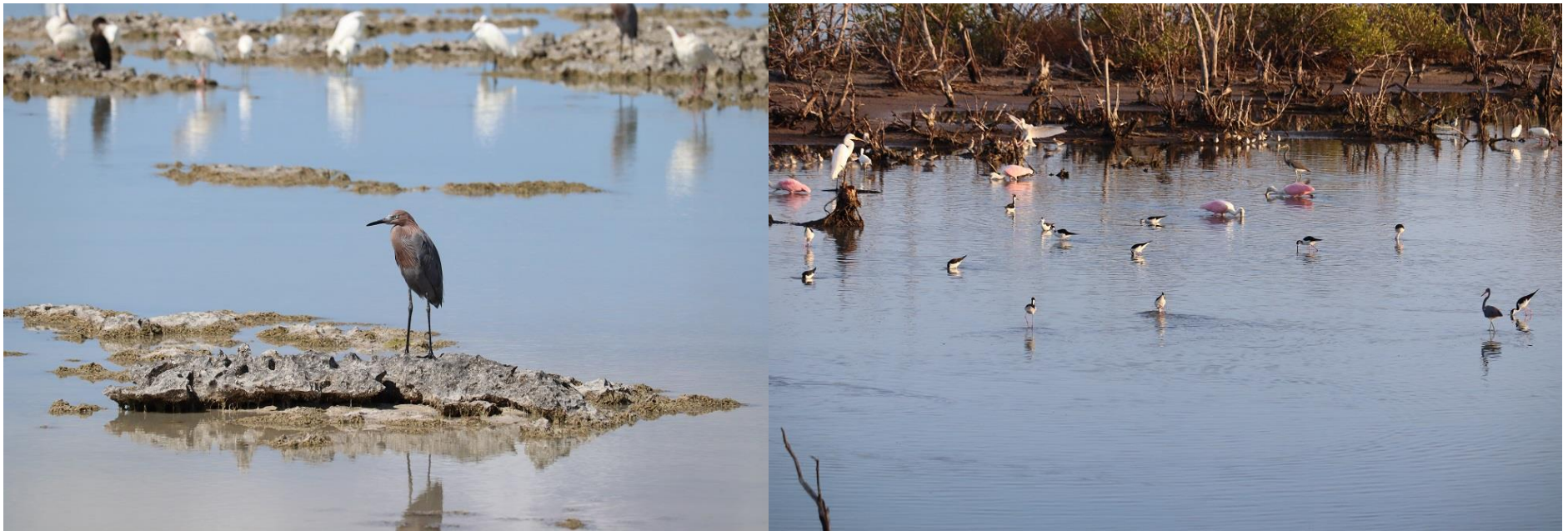
Reddish Egret, Black-necked Stilt, Roseate Spoonbill, Great Egret and Tricolored Heron

Little Blue Heron – Egretta caerulea - Seen daily except on Santo Tomás.