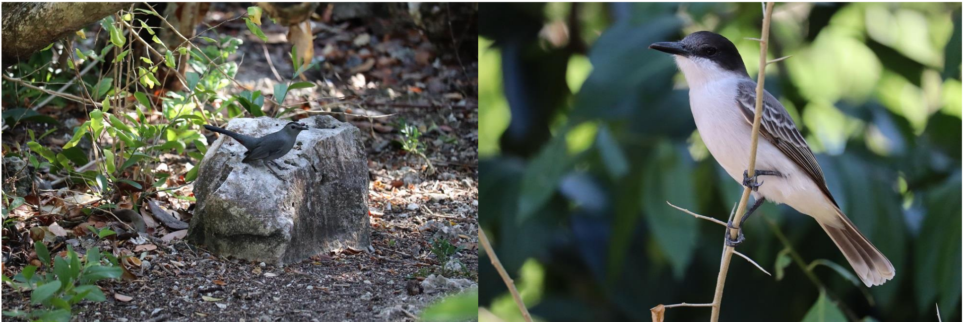
Gray Catbird and Loggerhead Kingbird

Cave Swallow - Petrochelidon fulva - Several hundred in Cueva de Los Portales, nesting, and on the way to Villa Clara.